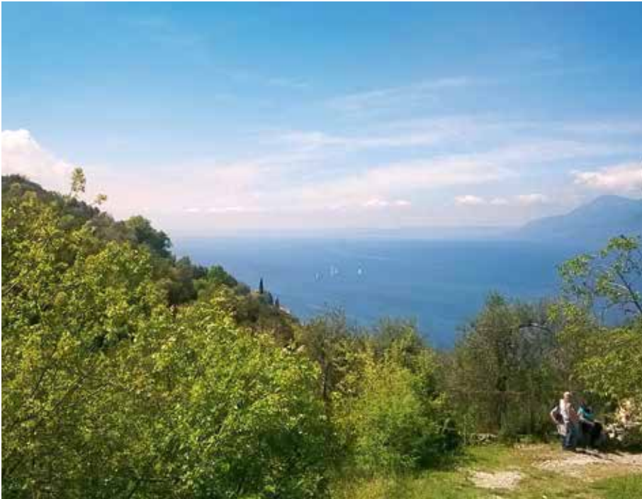
A view nearby Campo.

In Assenza, take the road to Sommovilla, Via Vecchia first and Via Degli Ivani , Via VI Alpini and Via Monteccio afterwards. At the end, take the mule track on the left, walk under a typical vaulting and follow the directions for path No. 31. Continue on this track up to Zignago. After the first bend, turn right and go down to the church in Castello. Take the left for a short slope and then turn right on a pebbled track, which then becomes a path through the fields and olive groves. At the first fork, keep the left. At the second fork past a little church, keep the left up to the spot Cà Romana. Walk on asphalt road for a while and continue upwards follow-