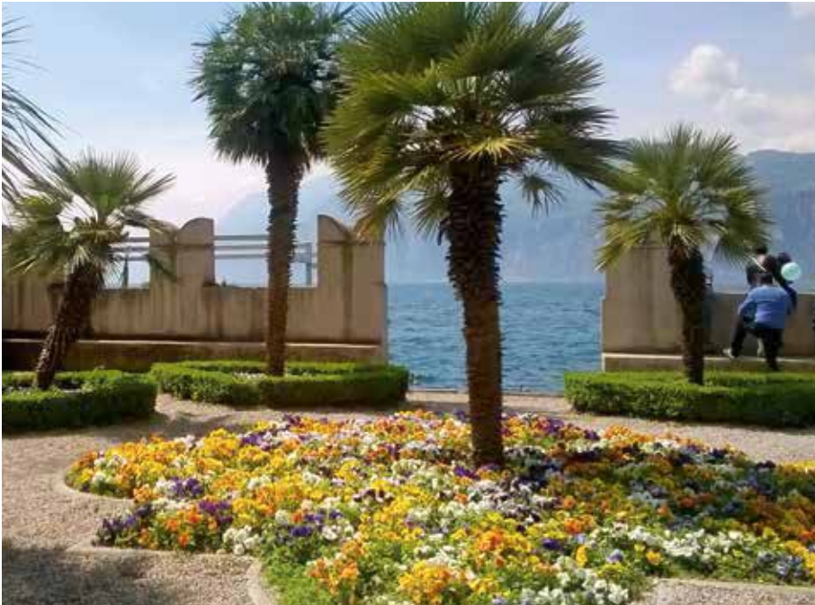
Malcesine – The Captain's Palace garden.

and walking lane along the lake up to Cassone. In Cassone, after the car park, leave the lane and take Via Gardesana . Pass river Aril, cross the road, ride on Via Chiesa up to the junction with Via Somnavilla . Once in Somnavilla, continue uphill and downhill towards Borago. Ride through it in Via Belvedere and reach the village Castello. Descend along Via San Benedetto and Via Boccino to reach Magugnago, seat of the Town Hall of the municipality of Brenzone sul Garda. Continue southwards along the State Road Gardesana Orientale for a few meters. Then, turn right and take the cycling and walking lane. Ride on prudently up to Pasola, a hamlet after Castelletto. Cross a small metal bridge and take the busy State Road Gardesana. After