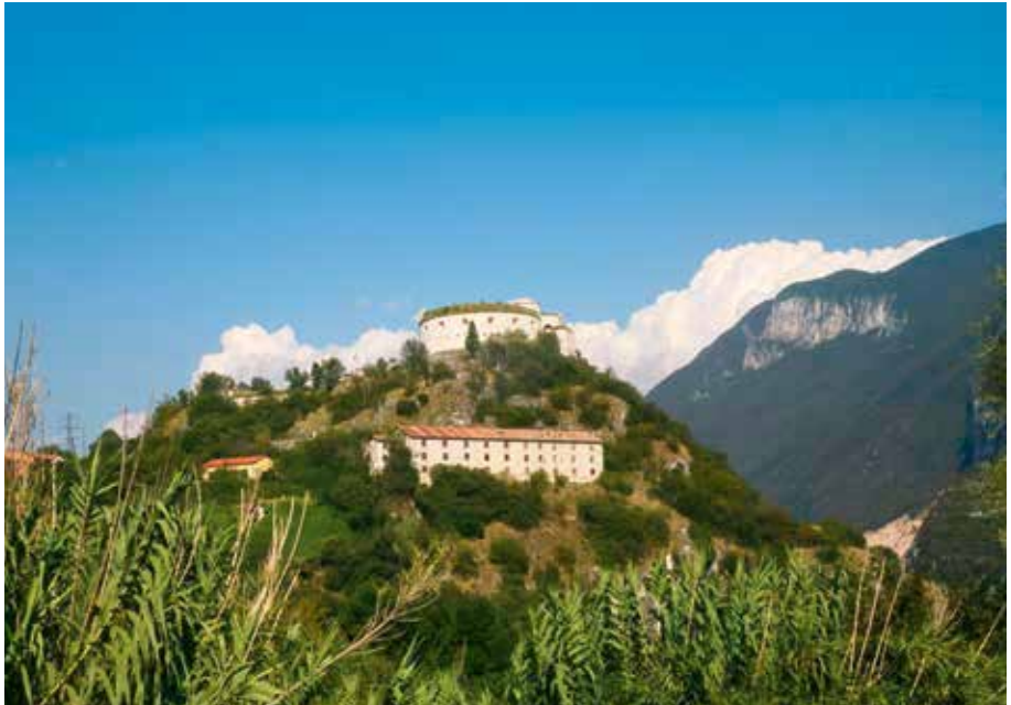
Austrian Fortress and Italian Barracks, Rivoli.

pedestrians may even be somewhat arrogant. As it is open to everybody, we recommend to use common sense. Six well-equipped relax areas are available along the way. Departure in the center of the borough Chievo by Villa Pullè. Follow the road directions towards San Vito al Mantico through Via Turbina . Cross the canal after 800 meters and turn left taking the cycling and walking lane Ciclopedonale Adige Biffis up to Bussolengo. The lane leaves the canal and runs upwards to the town. Pass the cemetery and turn right in Via Giuseppe Mazzini . Continue in Via Mazzini at a roundabout and ride on in Via Roma . Turn right in Via Pol almost at the end of the slope, cross the canal and turn left taking the lane. You will enjoy a stunning landscape, particularly during springtime. After two panoramic