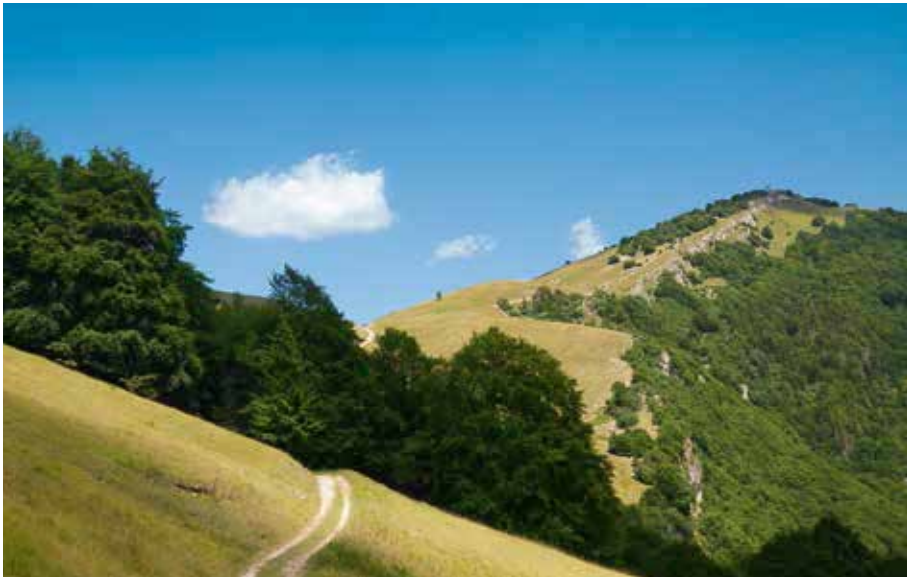
Towards Cerbiolo Pass.

Departure in front of the mountain hut Novezzina. Take the easy path “Michele Dusi”, cross the Botanical Garden , go down to the Astro-