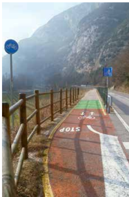
One of the crossing spots.

The village and the church in Preabocco Stone fountain and washtub in Brentino Parish church in Brentino Ph. +39 045 7290046 Parish church in Rivalta Parish church in Belluno Veronese Archaeological excavations Rural church Pieve Sant'Andrea (11th-12th century)