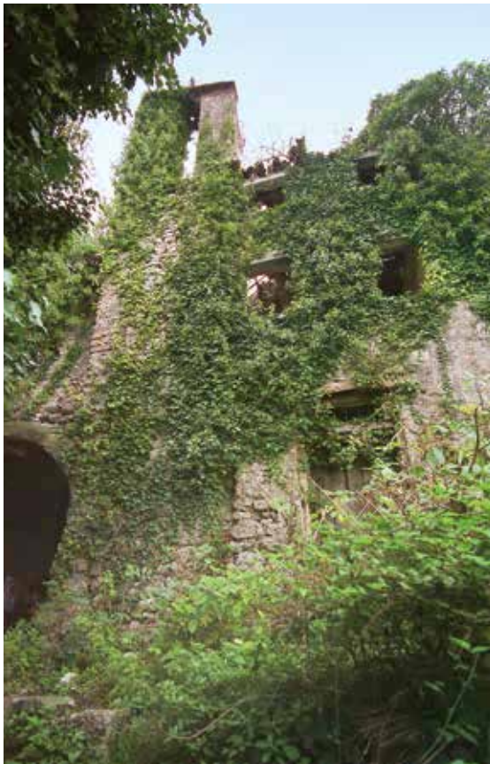
Campo, an abandoned village.

ing the directions to Campo. Take a dirt road, which then becomes a mule track, and continue reaching Campo, a well-known abandoned village. The most demanding part of the track is over. Take the path on the left of the stone washtub in Campo and walk down on the mule track to Fazor and Biazza among olive groves. Turn right at the fork with a votive aedicule and take the steep slope towards Castelletto. Then, join the State Road Gardesana Orientale, cross