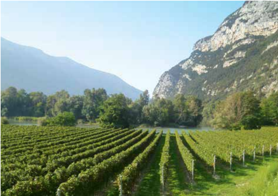
Valley Valdadige along the cycling lane Ciclopista del Sole.