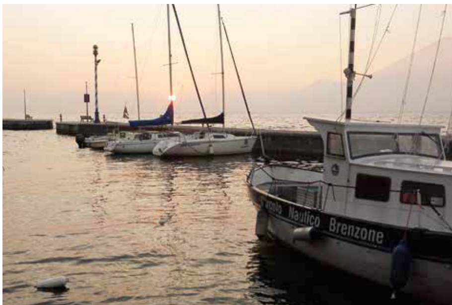
Small harbor on the lake.