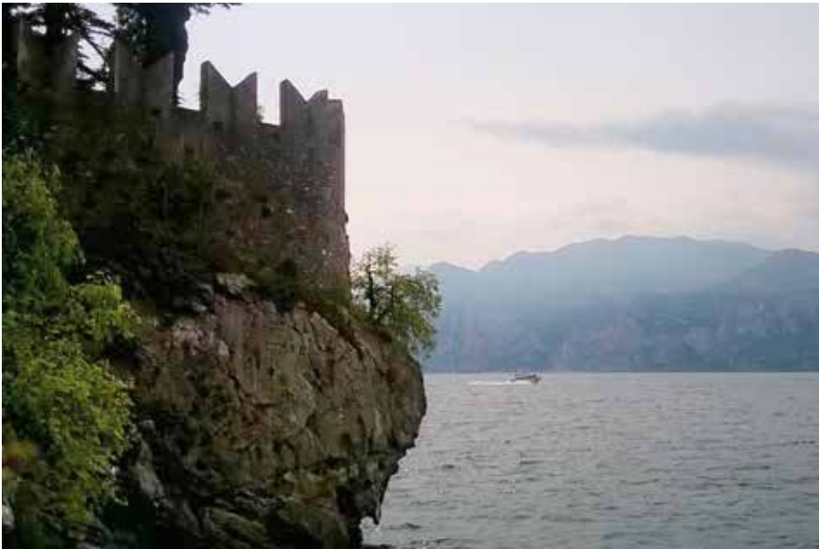
At the feet of the Castle in Malcesine.

Church San Nicola with 13th-14th century frescoes